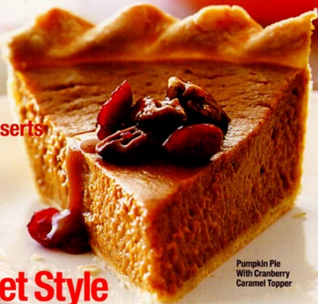
Pumpkin Pie With Cranberry Caramel Topper